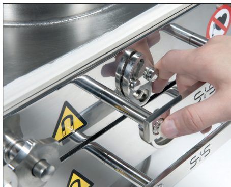
Latch arrangement for removing magnet cores from the tubes - EASY CLEAN feature