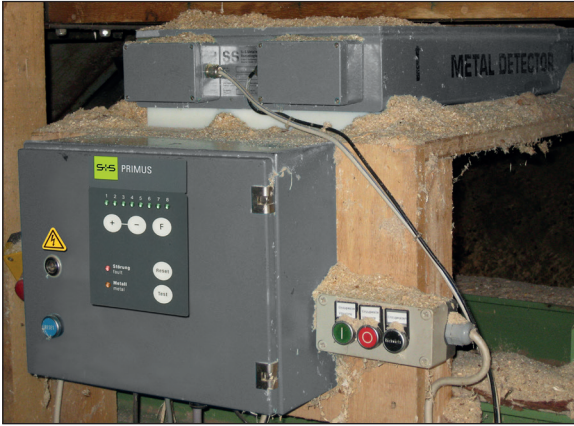
Installation example: Plate type detector ELS with control unit PRIMUS analysing wood off-cuts (old version)